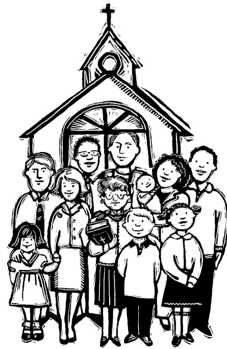
Our Church Family

Look for new membership directories next month!